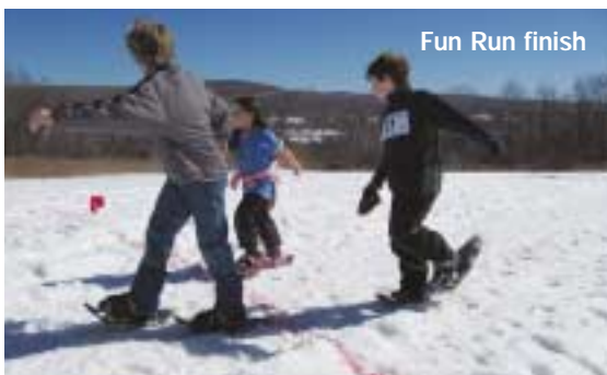
Fun Run finish