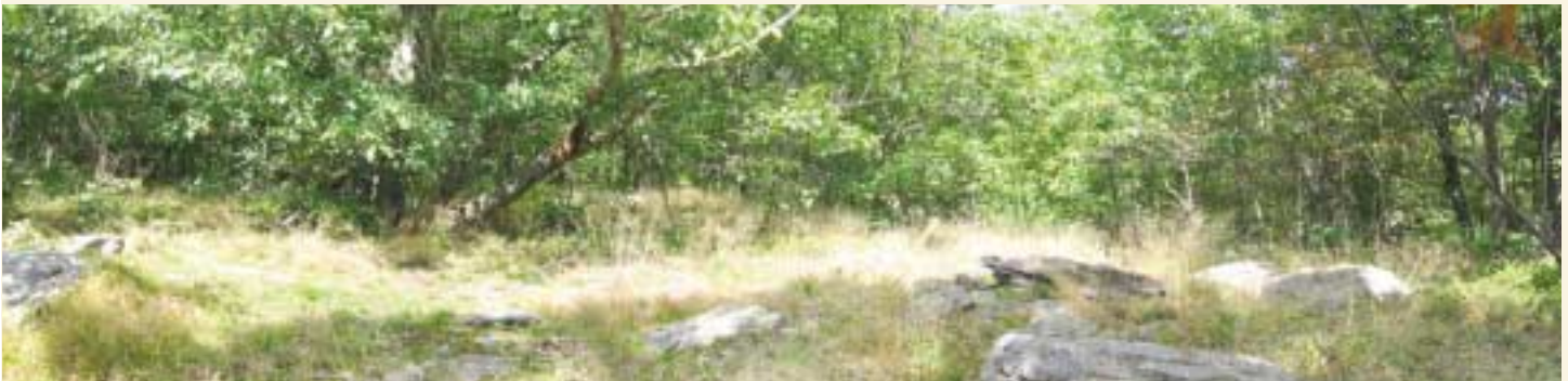
Mahanna Cobble summit

The ski area and its would-be buyers have differing