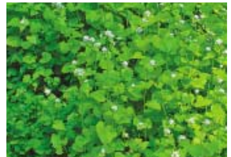
Garlic Mustard Monoculture