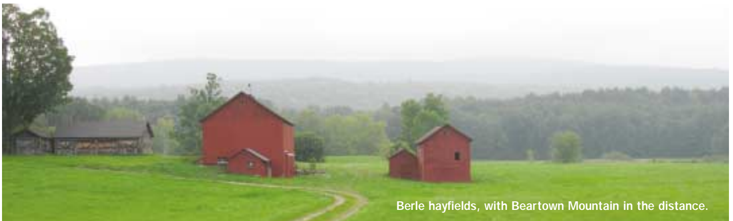
Berle hayfields, with Beartown Mountain in the distance.